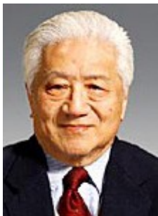
Bishop K.H. Ting

The World Student Christian Federation was saddened by the passing of Bishop K.H. Ting on November 22. Bishop Ting was one of China's most important church leaders and Christian thinkers of the late 20 th century. Committed to the work of the Student Christian Movement and the World Student Christian Federation, Bishop Ting was appointed mission secretary for SCM Canada in 1945.